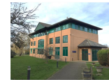
Building of College House commences

Face-to-face revision programme introduced